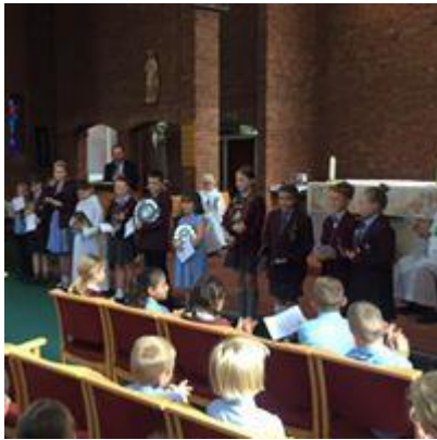
2017 Award Winners

Life at St. David's is about much more than formal learning. We are concerned with the development of the whole child. This means that developing social, personal and communication skills, building self-confidence and promoting a love for life is as important to us as academic learning. We are fortunate in the resources available to us (our people, environment and facilities) that we can offer a rich and diverse experience for all our pupils, supporting their development and encouraging their interests in a wide variety of ways. Throughout the year we share and celebrate our life and faith within school, the parish and the wider community. We are also proud of our Welsh heritage and culture, and celebrating this is important to us.