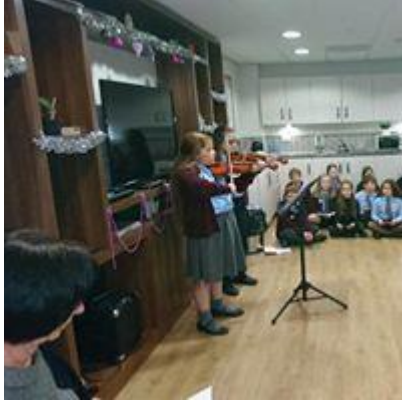
Our Mini-Vinnies in action.