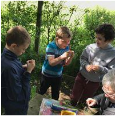
Forest school fun!