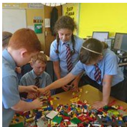
Team Work Challenge Day

We are always striving for different ways to engage our children and so this year to enhance our pupils learning we continued with the "Taste Of " and "Challenge" days which proved extremely enjoyable and beneficial. During these days the children were grouped into teams and houses across the school instead of the traditional classes and had the opportunity to learn many different skills and taste foods from different parts of the world among other things.